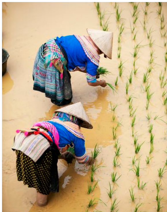
Above: Indigenous Hmong women plant rice shoots in Bac Ha, Viet Nam.

Source: Asia Indigenous Peoples Pact (AIPP) and International Work Group for Indigenous Affairs (IWGIA). 2014. "Indigenous women in REDD+: Making their voice heard".