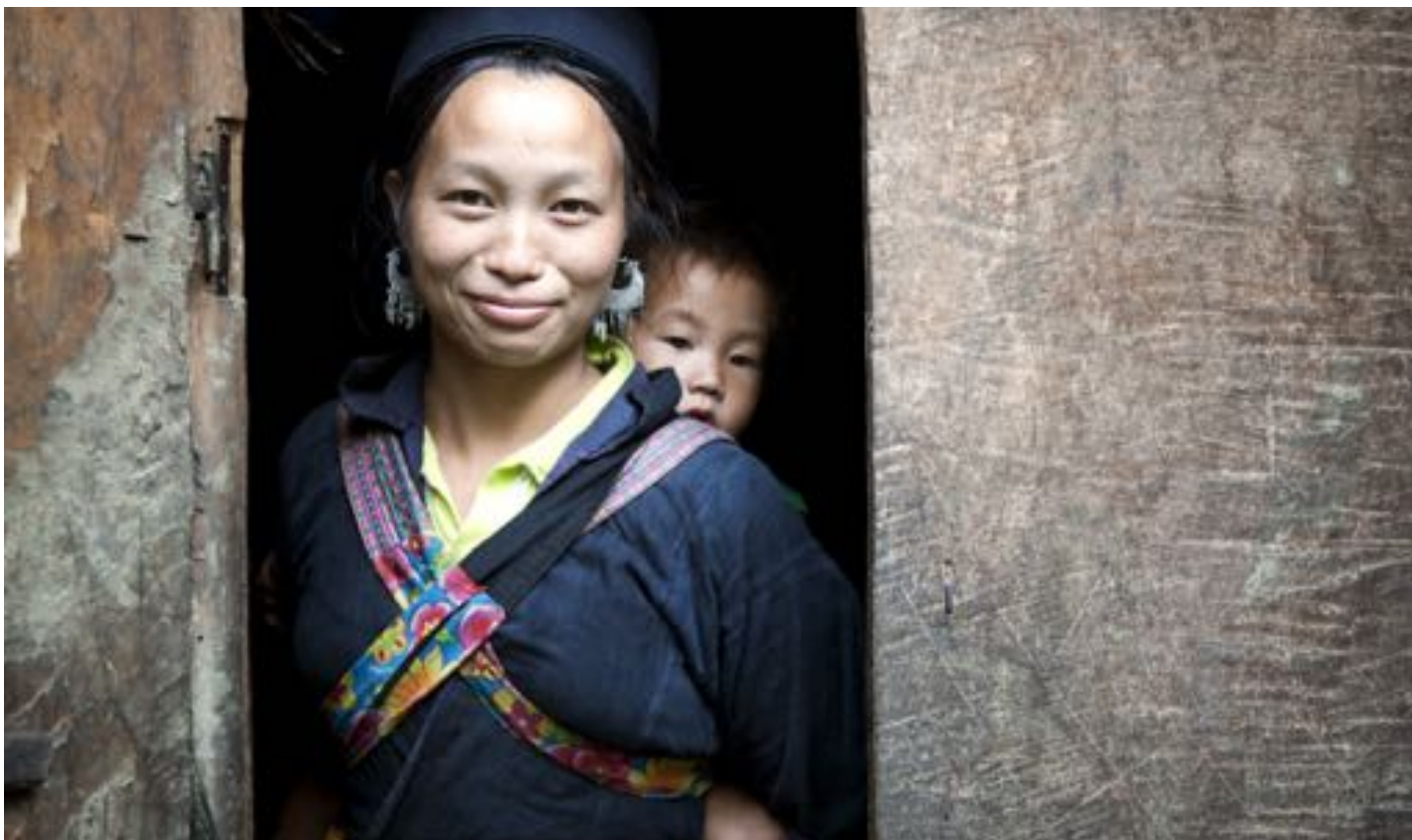
From top: A participant at the First World Conference on Indigenous Peoples © UN Photo / Loey Felipe. A Hmong woman and her baby in the village of Sin Chai, Viet Nam. © UN Photo / Kibae Park.